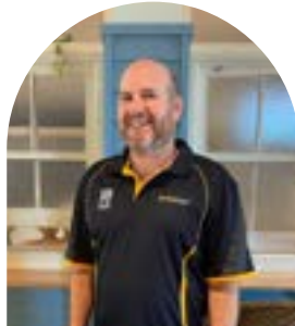
CHRIS FULL MOON HOTEL