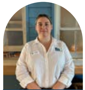
EMALIEH DUTY MANAGER