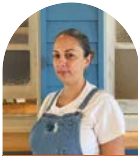
EM RESTAURANT TEAM LEADER