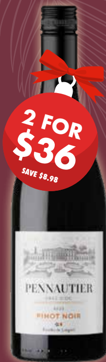
Marquis De Pennautier Pinot Noir $21.99 SINGLE

Our French selection of Pinot Noir. Just in time for an Australian summer, perfectly juicy, fresh and lively. Why not take the edge off with a little chill? Perfumed and light/medium weight ensures this selection allows you to travel abroad all be it in a glass or two!