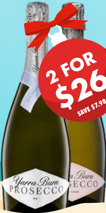
YARRABURN PROSECCO & PROSECCO ROSÉ $13.99 SINGLE NORMALLY $16.99