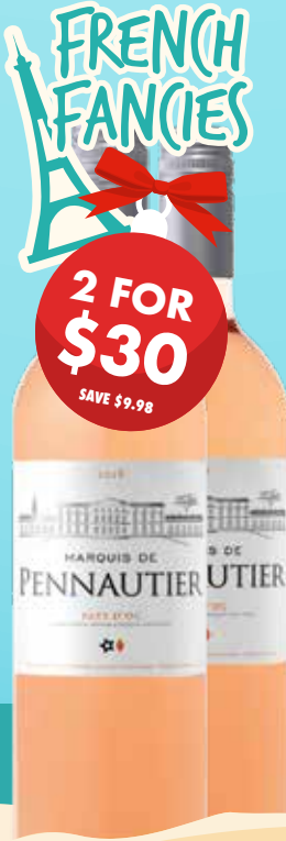
MARQUIS DE PENNAUTIER ROSÉ $15.99 SINGLE NORMALLY $19.99