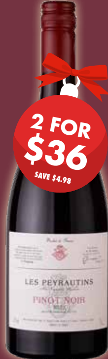
Les Peyrautins Pinot Noir $21.99 SINGLE