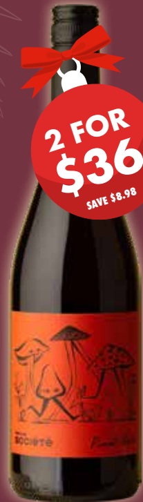
Fringe Society Pinot Noir $21.99 SINGLE