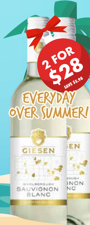
GIESEN SAUVIGNON BLANC $14.99 SINGLE NORMALLY $16.99